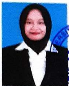
Trisa Khairurrahmah Tanda tangan pemilik Signature of Certificate Holder